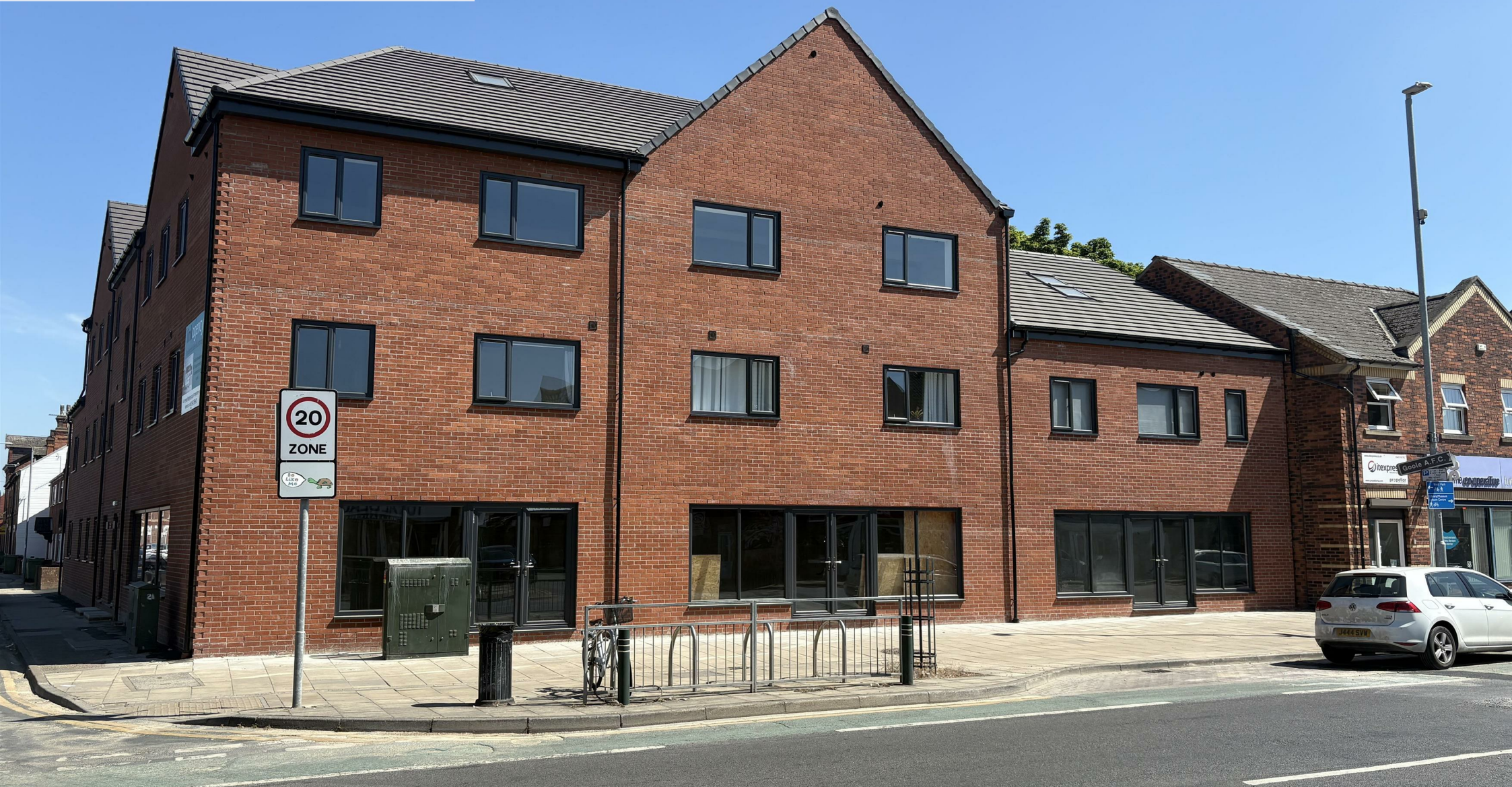
Carlton Apartments, Goole, DN14 6DG £525 PCM